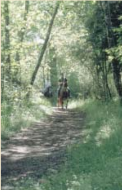
Riding is a popular pastime at Elijah Bristow State Park.

The east end of Elijah Bristow State Park is home to Dexter State Recreation Site, picnicking and boat launching area. This 100-acre parcel with spectacular views of the Cascade foothills offers boat/trailer parking for 70 vehicles, a restroom (no water) and a trail that connects to Elijah Bristow State Park to the west. Area anglers know the park as a great place to fish for small and large mouth bass, crappie and trout. The lake is a popular spot for sailing as well as powerboat activities.